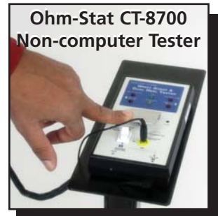
Adjustable limits. Test each foot and wrist individually and simultaneously

When used with a computer and leading edge software the employee's test results are stored in the computer and then can be emailed to supervisors. NO MORE LOG BOOKS. These reports and data can help conform your company to 20/20 specifications or ISO conformance. Speed up testing, and eliminate no tests.